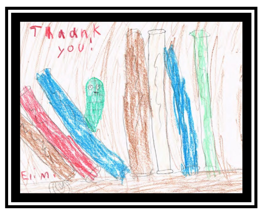
Thank You Notes from Stillwater Homeschool Group for a library tour on April 19, 2017